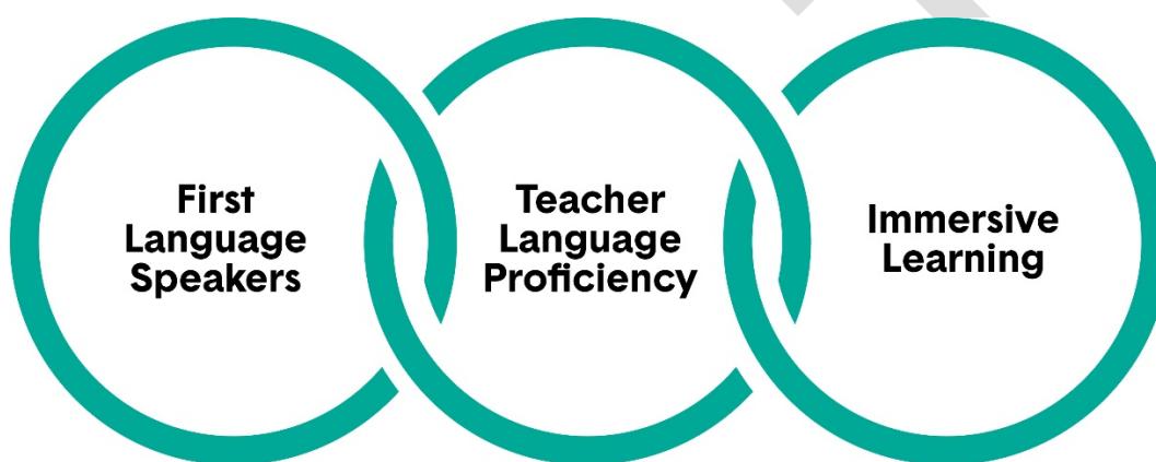
Figure 1: Important Context for the Development and Delivery of AQ Course

Learning of any kind in an immersion setting, when it comes to endangered languages such as Onondaga, is identified as a priority, and so the design and delivery of the Additional Qualification Course: Teaching Onondaga is envisioned as happening with an understanding that instruction and content be in Onondaga, as skills permit, across the entire Additional Qualification course. Used cumulatively and in appropriate settings, it is believed that this will keep interest and incentive alive for candidates who are at an appropriate proficiency level. To provide incentive for those at a lower proficiency level, foundational language learning in Onondaga may be offered to candidates wanting to take the Additional Qualification course.