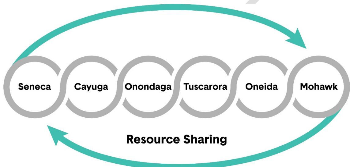
Figure 2: Resource Sharing Across Ogwehóweh Languages

These are only a sampling of what can be additionally considered for the development and delivery of the Additional Qualification course (Figure 2). It is assumed that further considerations of theory and cultural understanding will eventually enter into development and delivery.