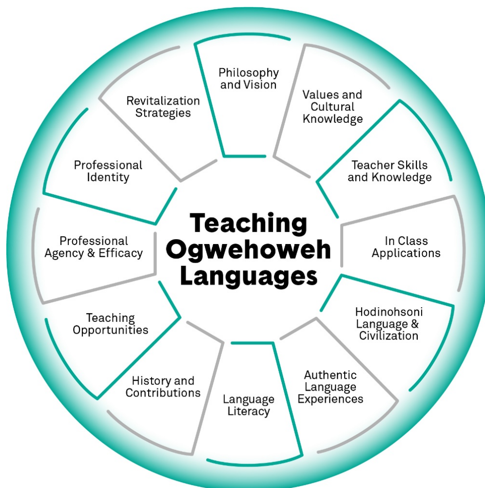
Figure 3: Learning Expectations