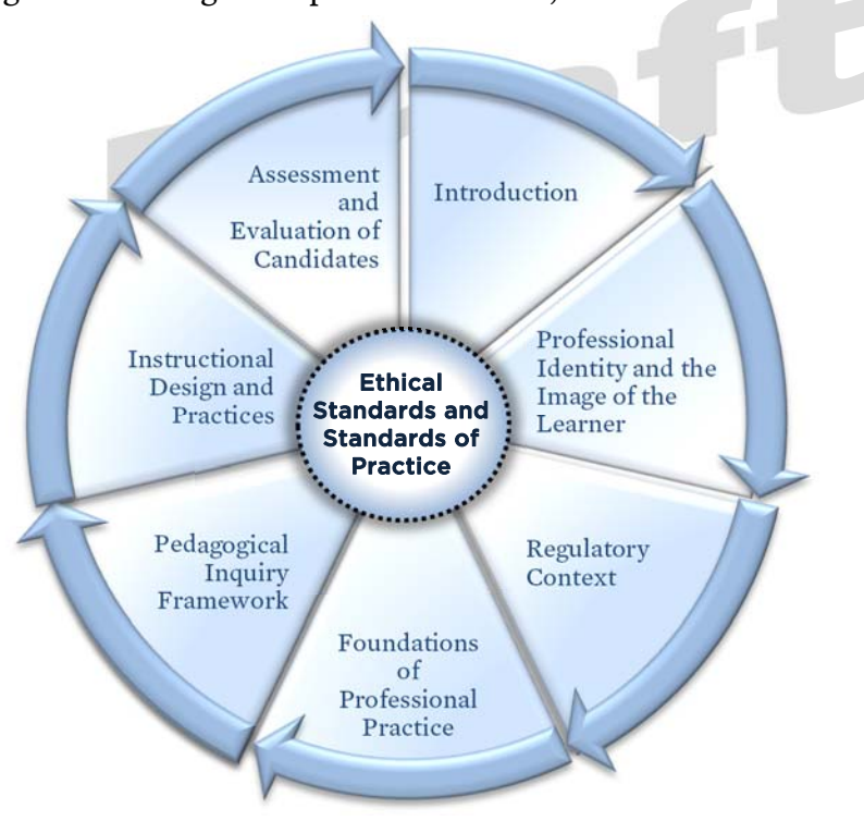
Figure 1: Conceptual Framework

The Additional Qualification (AQ) guideline: Honour Specialist Physics is organized using the following conceptual framework,