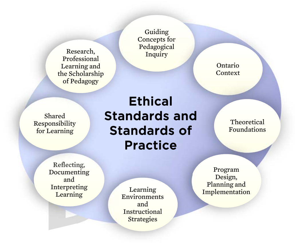
Figure 4: Pedagogical Inquiry Framework for Honour Specialist Physics