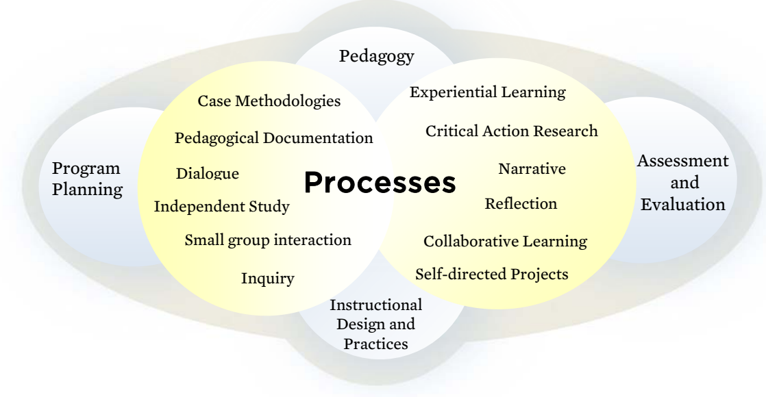
Figure 5: Instructional Processes

In the implementation of this Additional Qualification course, instructors facilitate andragogical processes that are relevant, meaningful and practical to provide candidates with inquiry-based learning experiences related to program design, planning, instruction, pedagogy, integration and assessment and evaluation. The andragogical processes include but are not limited to: experiential learning, role-play, simulations, journal writing, self-directed projects, independent study, small group interaction, dialogue, action research, inquiry, pedagogical documentation, collaborative learning, narrative, case methodologies and critical reflective praxis.