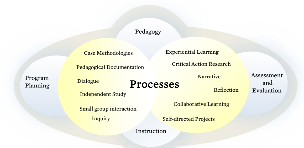
Figure 5: Instructional Processes

projects, independent study, small group interaction, dialogue, action research, inquiry, pedagogical documentation, collaborative learning, narrative, case methodologies and critical reflective praxis.