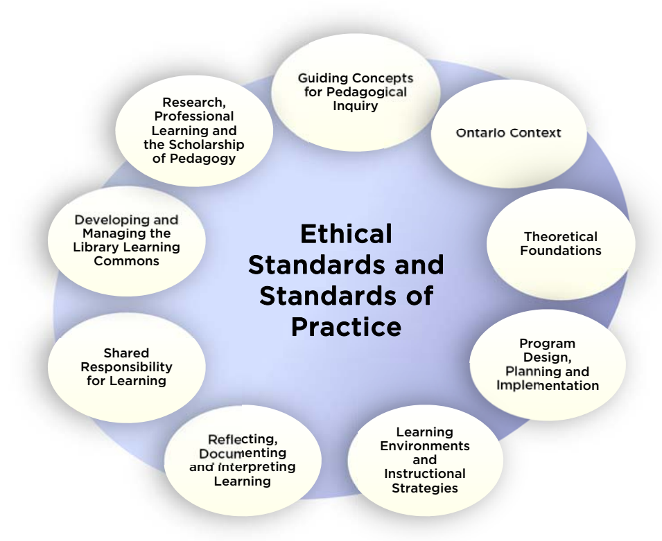
Figure 4: Pedagogical Inquiry Framework for Teacher Librarian, Part II