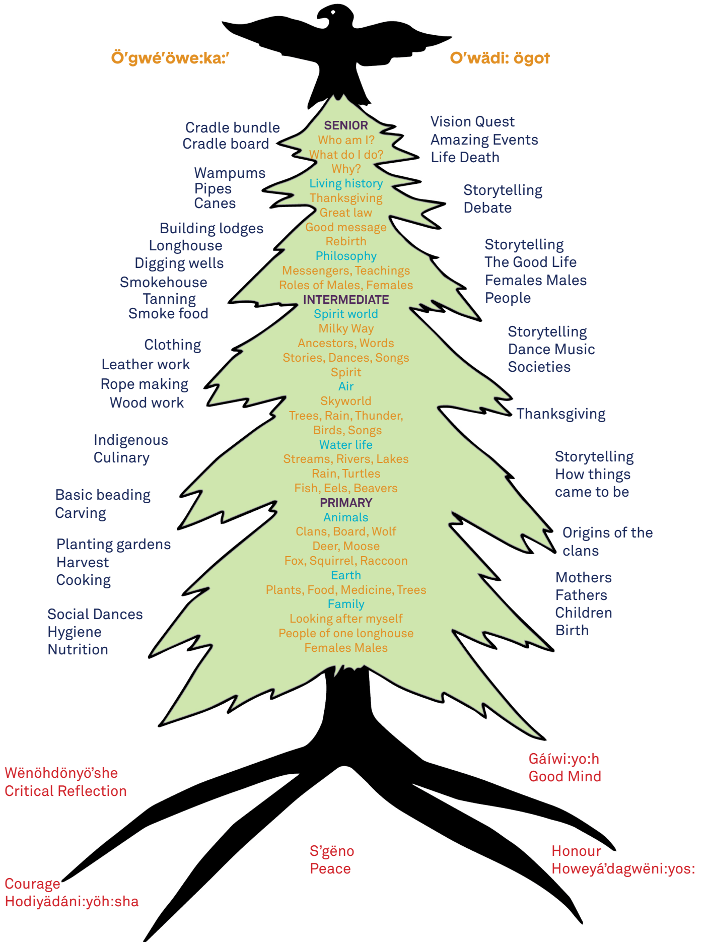
Figure 2: Onëhdaji'gowa:h (Tree of Great Peace)